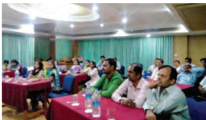
CPE training program in Pune.

As an NISM accredited CPE Provider for conducting the Depository Operations Program, CDSL has conducted a CPE training program in Chennai on June 06, 2015, Pune on June 13, 2015 and Mumbai on June 26, 2015.