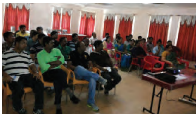
CPE training program in Chennai.