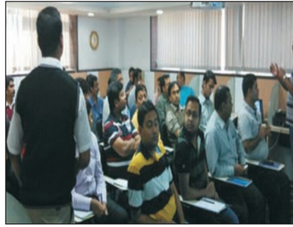
Compliance Training Program in Kolkata on November 29, 2014.