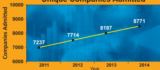
Unique Companies Admitted

The securities of almost all listed companies have been admitted with CDSL for demat. Further, a large number of Private Limited and unlisted companies are also admitted with CDSL. As on November 30, 2014, the securities of 8771 unique companies have been admitted for demat with CDSL.