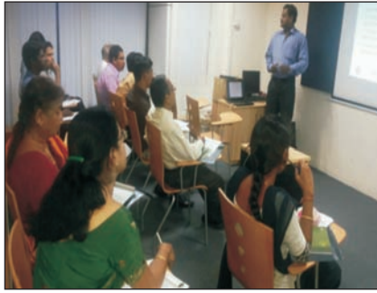
Compliance Training program in Chennai on November 29, 2014.